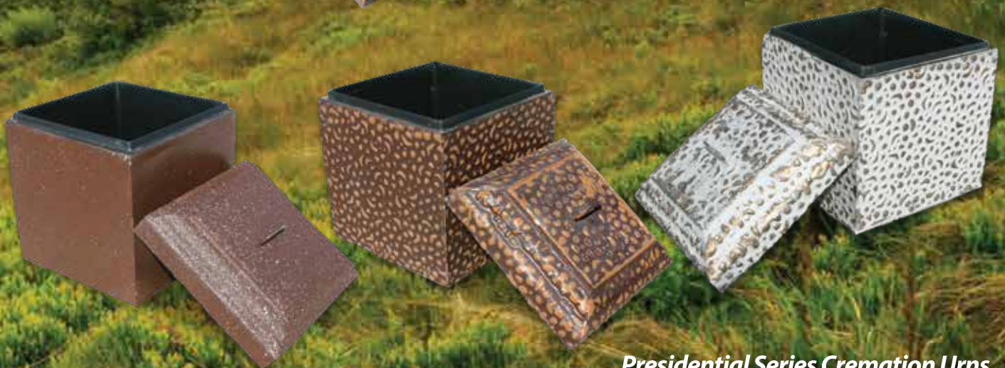
Presidential Series Cremation Urns